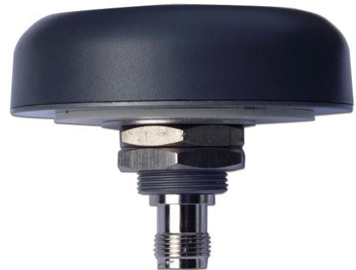
TW3710 / TW3712 Dimensions (mm)

The antennas are housed in a through-hole mount, weather-proof enclosure for permanent installations. L Bracket or Pipe Mount adapters (part numbers 23-0040-0, 23-0065-0 respectively) are available for non-rooftop installation. A 100mm ground plane is recommended for non-roof-top installations.